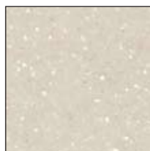
Sea Oat Quartz